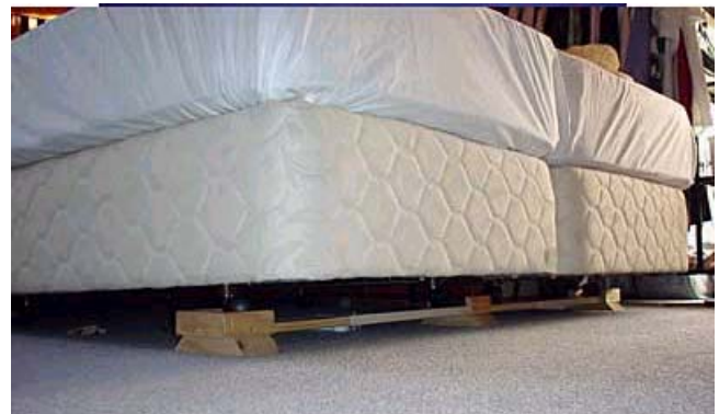
Double bed raiser gives a really solid base to the bed , no matter how high it is raised